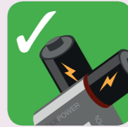
Batteries in a separate bag