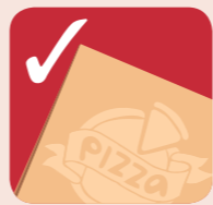
Greasy pizza boxes