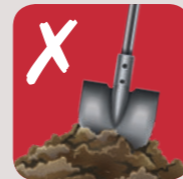
Soil and stones

Remember – Subscribe to the collection service – details online. Garden waste can be composted at home – order a discounted compost bin online at surreyep.org.uk .