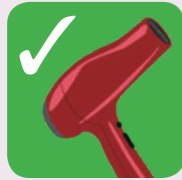
Anything with a plug