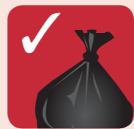
Black bin bags