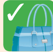
Bags and belts