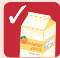
Food and drinks cartons