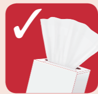
Tissues and wipes