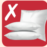
Pillows and duvets

Remember – Items must be clean, dry and in no more than one tied carrier bag placed next to your bin.