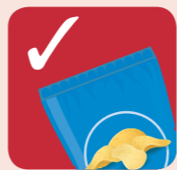
Crisp packets and wrappers