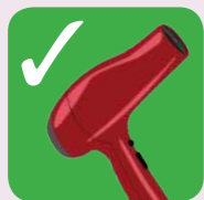
Anything with a plug