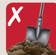
Soil and stones

Remember – Subscribe to the collection service – details online. Garden waste can be composted at home. Order a discounted compost bin online at surreyep.org.uk .