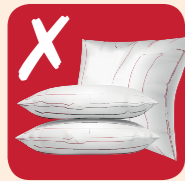
Pillows and duvets

Remember – Items must be clean, dry and in no more than one tied carrier bag placed next to your bin.