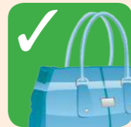
Bags and belts