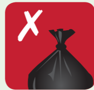
Black bin bags