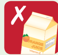
Food and drink cartons