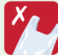
Plastic bags and cellophane