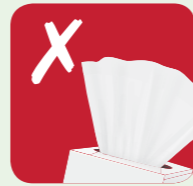
Tissues and wipes