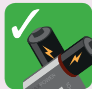
Batteries in a separate bag