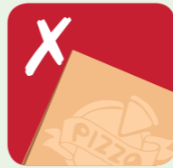
Greasy pizza boxes