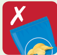
Crisp packets and wrappers