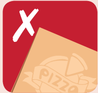
Greasy pizza boxes