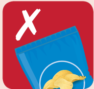
Crisp packets and wrappers