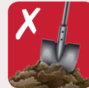
Soil and stones

Remember – Subscribe to the collection service – details online. Garden waste can be composted at home - order a discounted compost bin online at surreyep.org.uk .