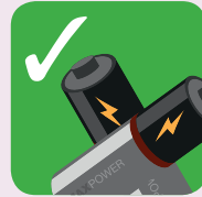
Batteries in a separate bag