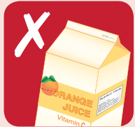
Food and drink cartons