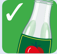
Glass bottles and jars