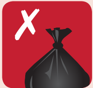
Black bin bags