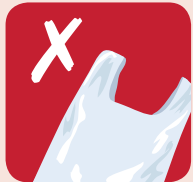
Plastic bags and cellophane