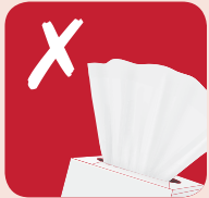
Tissues and wipes